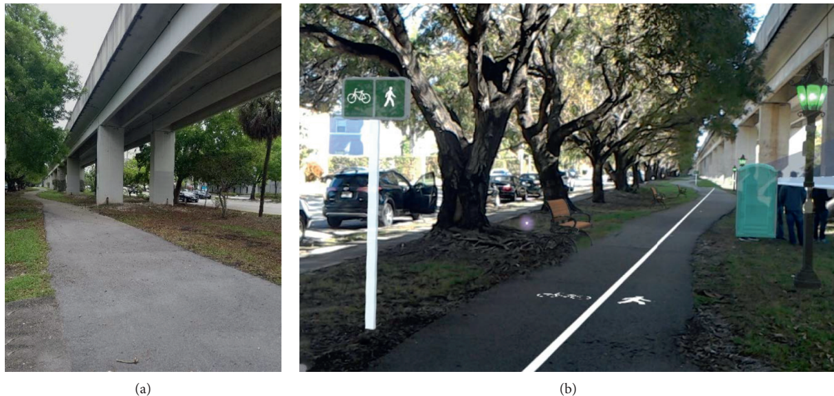
FIGURE 2: Environment not including (a) and including (b) the augmented reality displays of (from right to left) a transparent wall, light fixtures, bathroom, lane separations for bikes and pedestrians, benches, and signage.