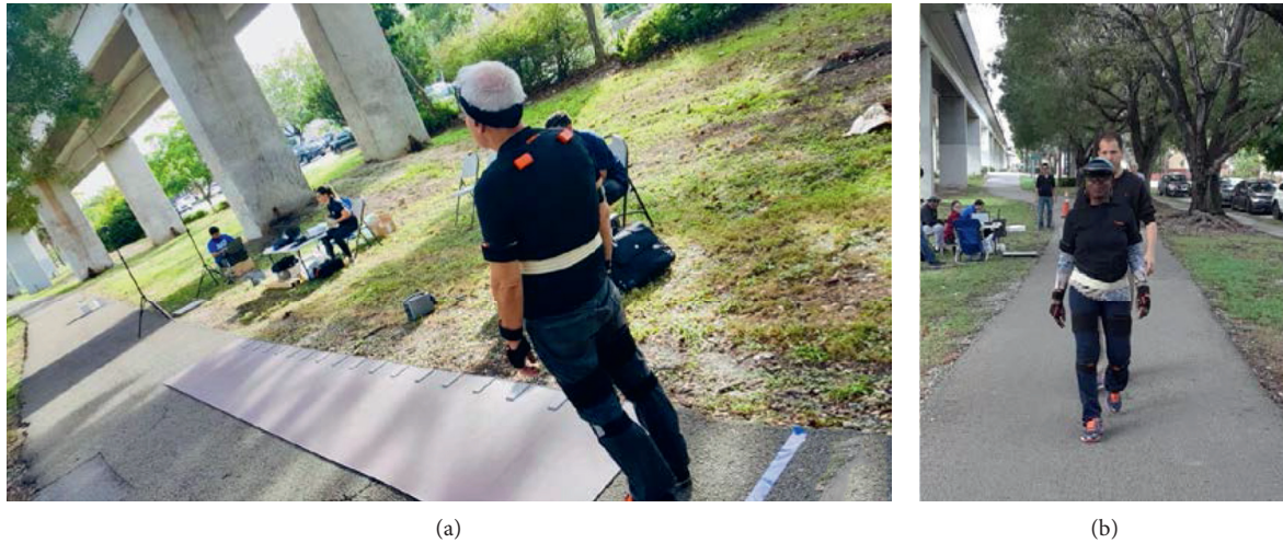
FIGURE 1: Participant at the beginning of the mat before initiating a walking trial (a) and a participant finishing the walk after crossing the mat (b).