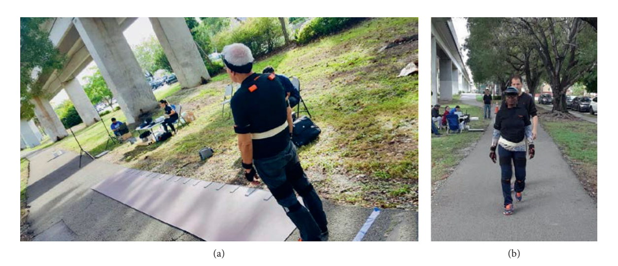
FIGURE 1: Participant at the beginning of the mat before initiating a walking trial (a) and a participant finishing the walk after crossing the mat (b).